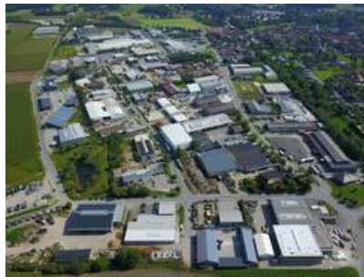
Industriegebiet 170828 (17).JPG