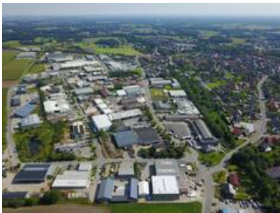
Industriegebiet 170828 (18).JPG