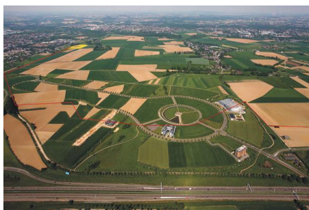
Grenzenlose Möglichkeiten auf AVANTIS!