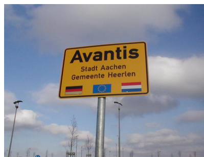
Verdoppeln Sie Ihre Chancen mit AVANTIS!