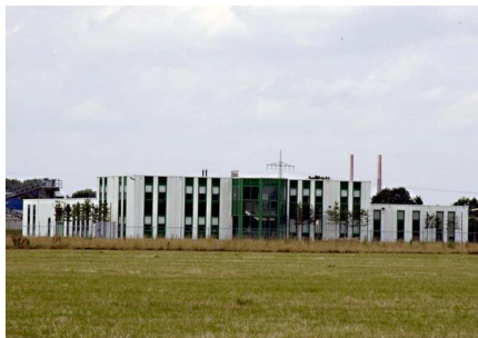
Gewerbe- und Industriegebiet Dremmen