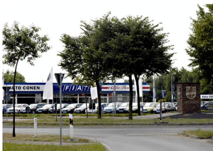
Gewerbe- und Industriegebiet Dremmen