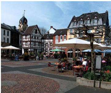
Alter Markt, Euskirchen