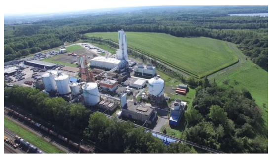
Süderweiterung 3 Chemiepark Knapsack.JPG