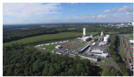
Süderweiterung 2 Chemiepark Knapsack.JPG